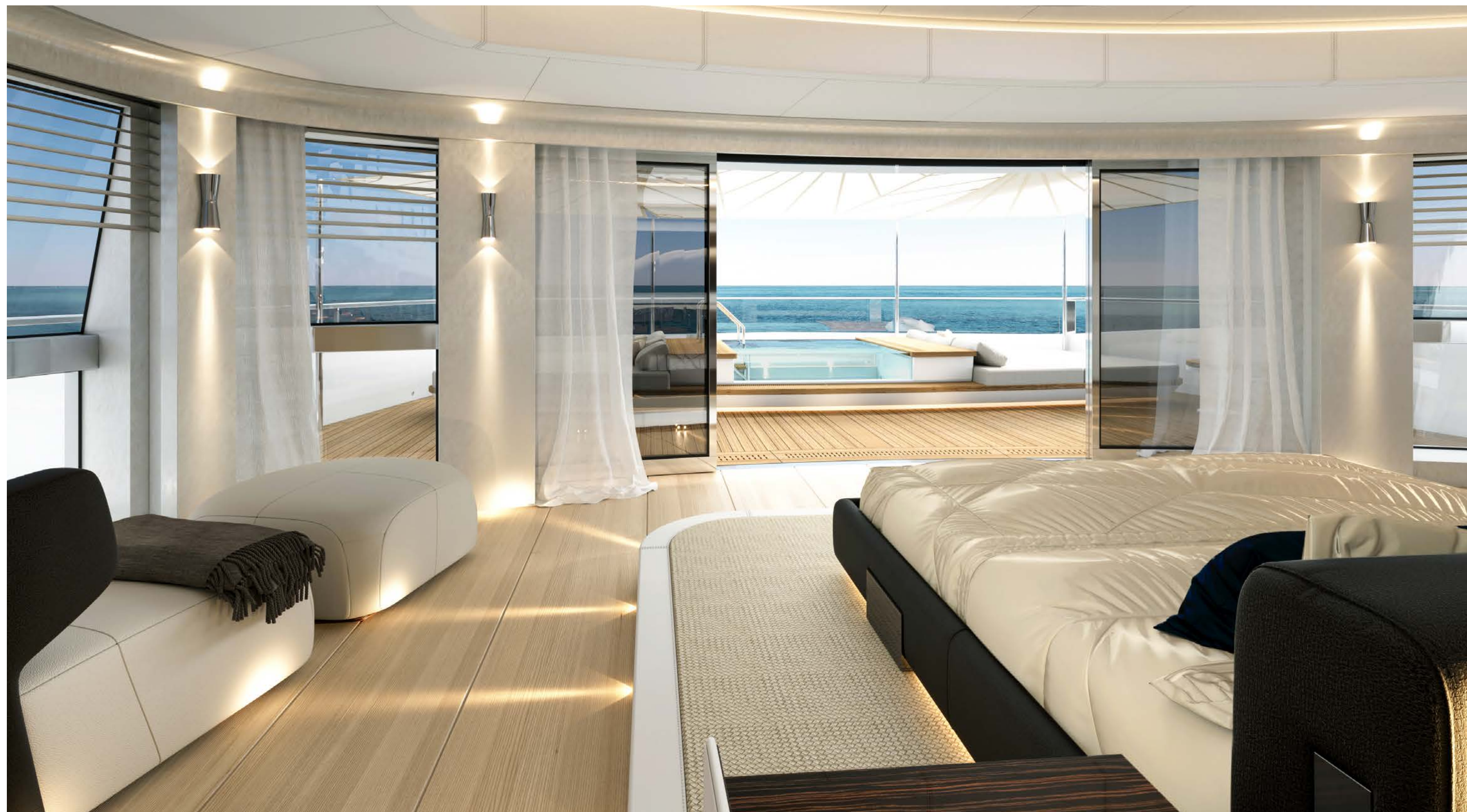
19. Owner's cabin

interior proposal by Tiziana Vercellesi Design