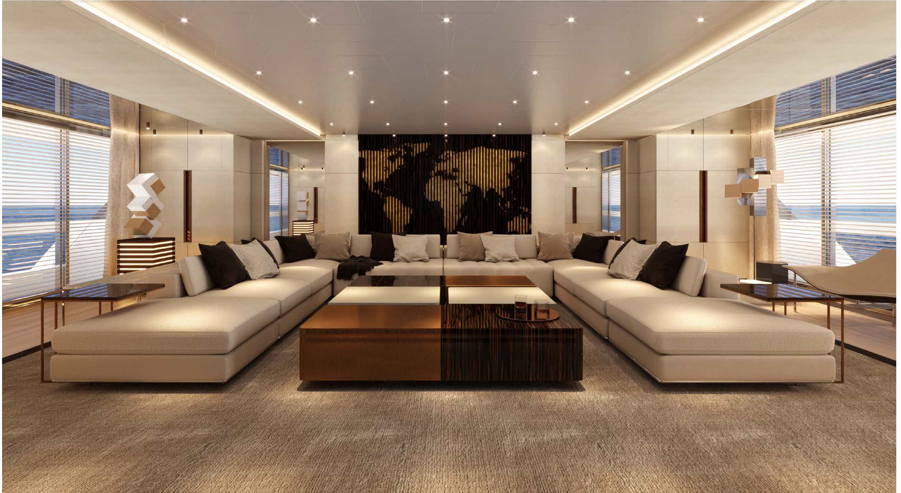
14. Main deck salon

interior proposal by Tiziana Vercellesi Design