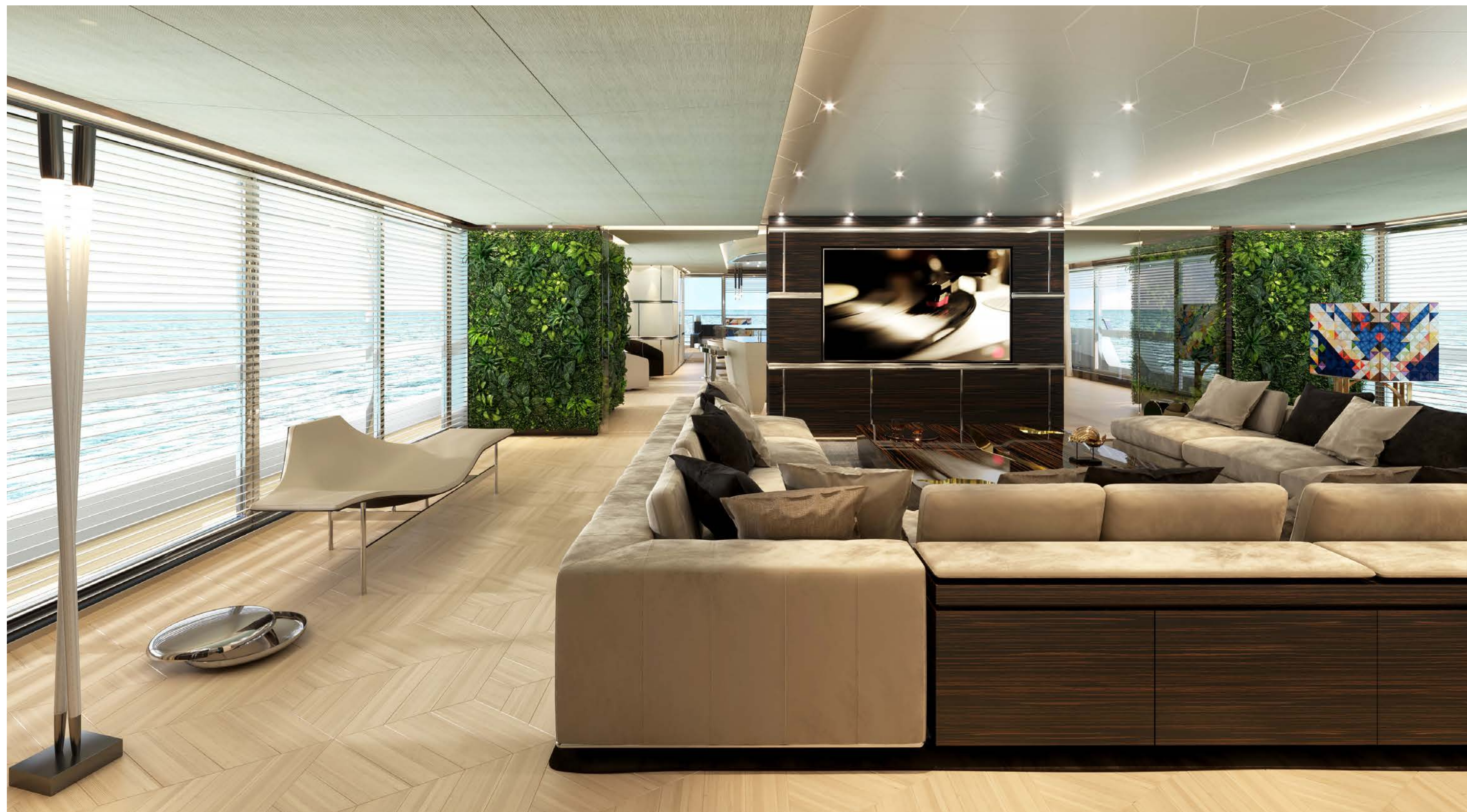
17. Main deck salon

interior proposal by Tiziana Vercellesi Design