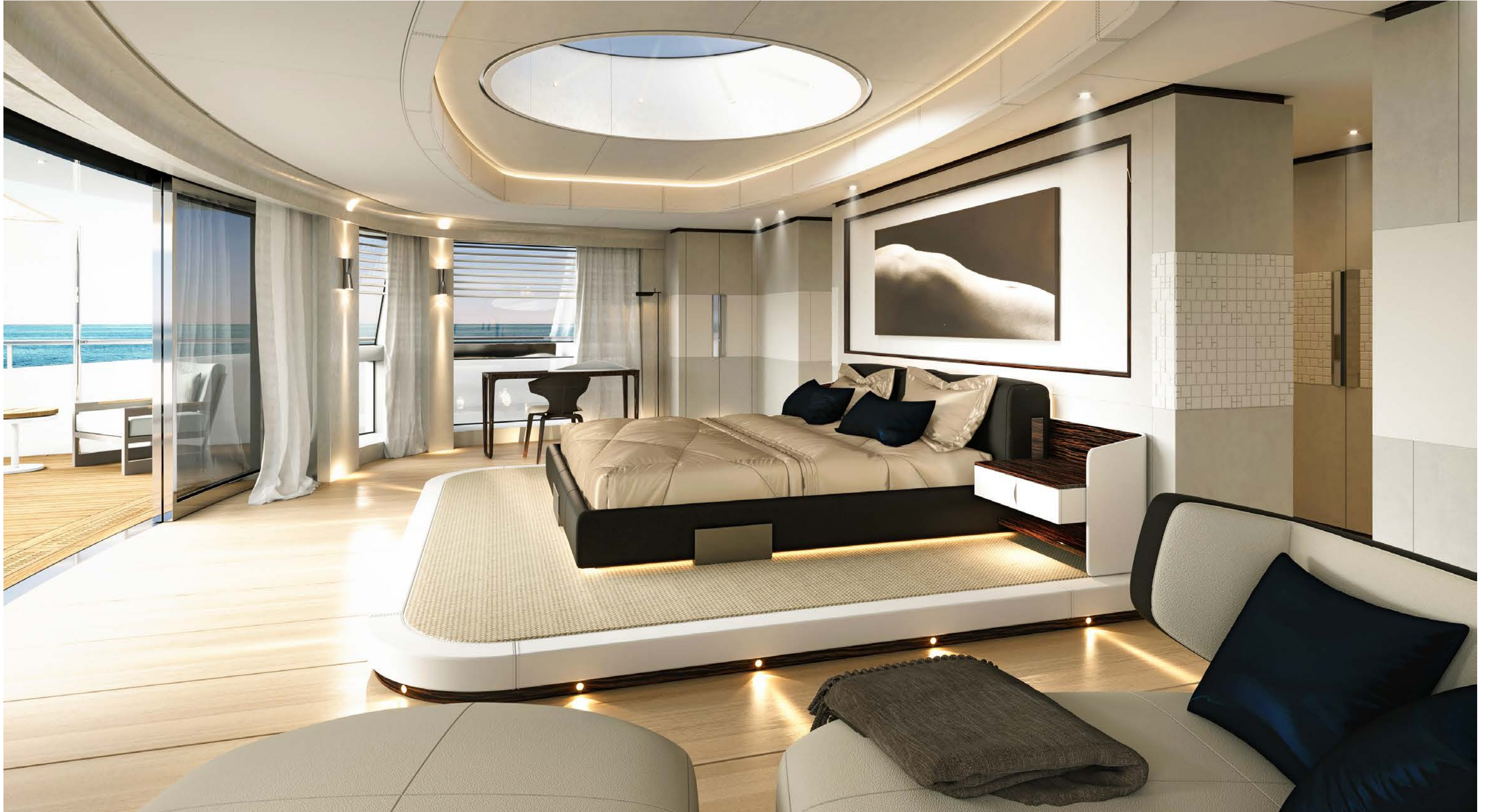
18. Owner's cabin

interior proposal by Tiziana Vercellesi Design