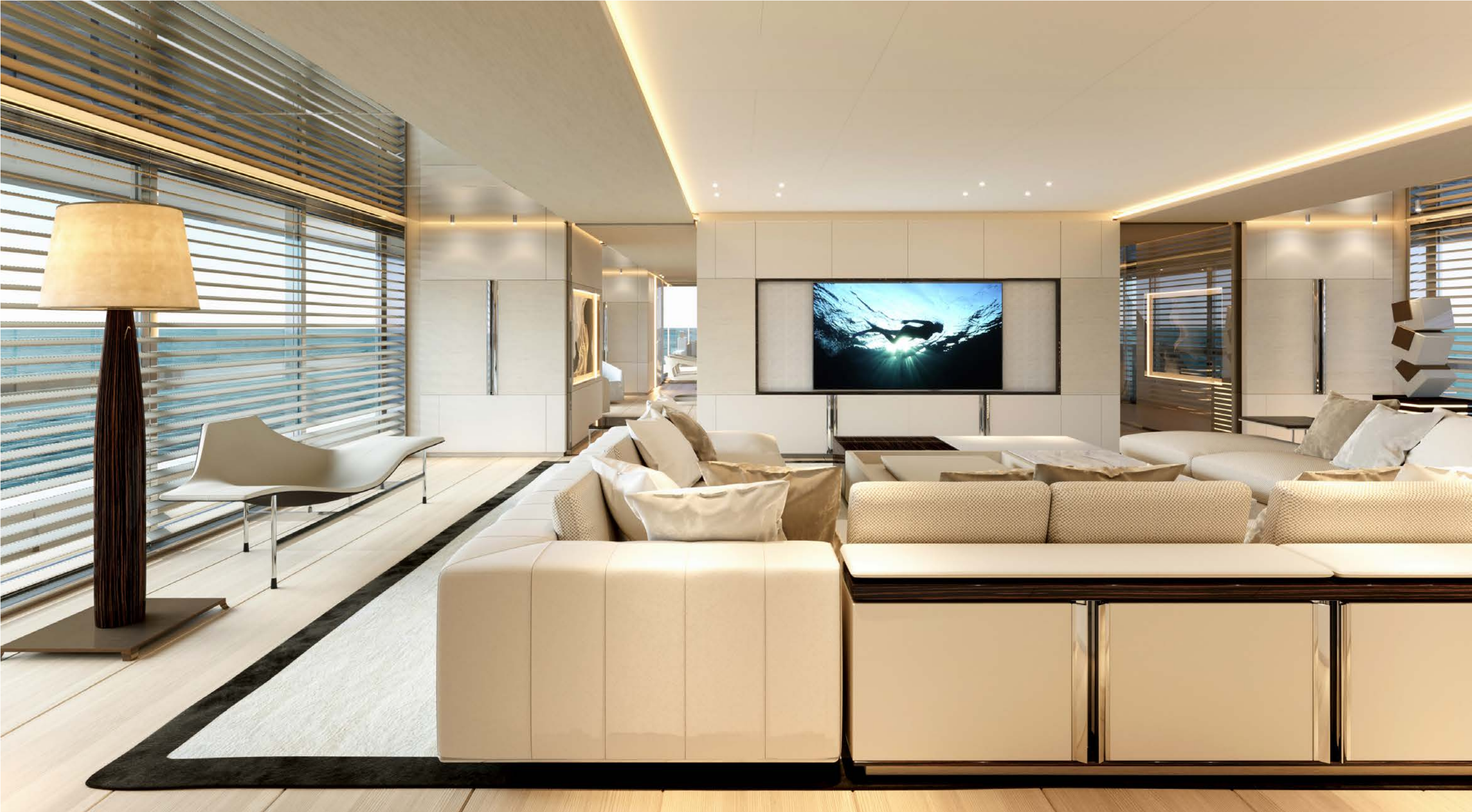
13. Main deck salon

interior proposal by Tiziana Vercellesi Design