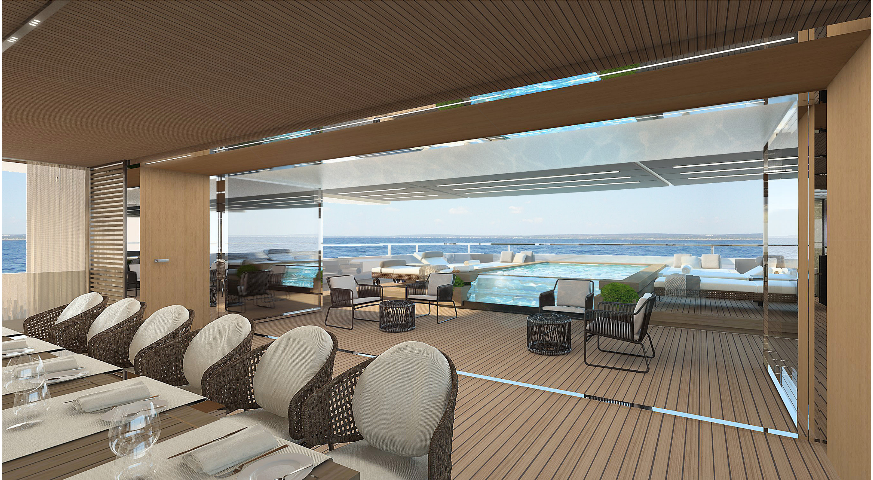
10. Main deck salon and cockpit