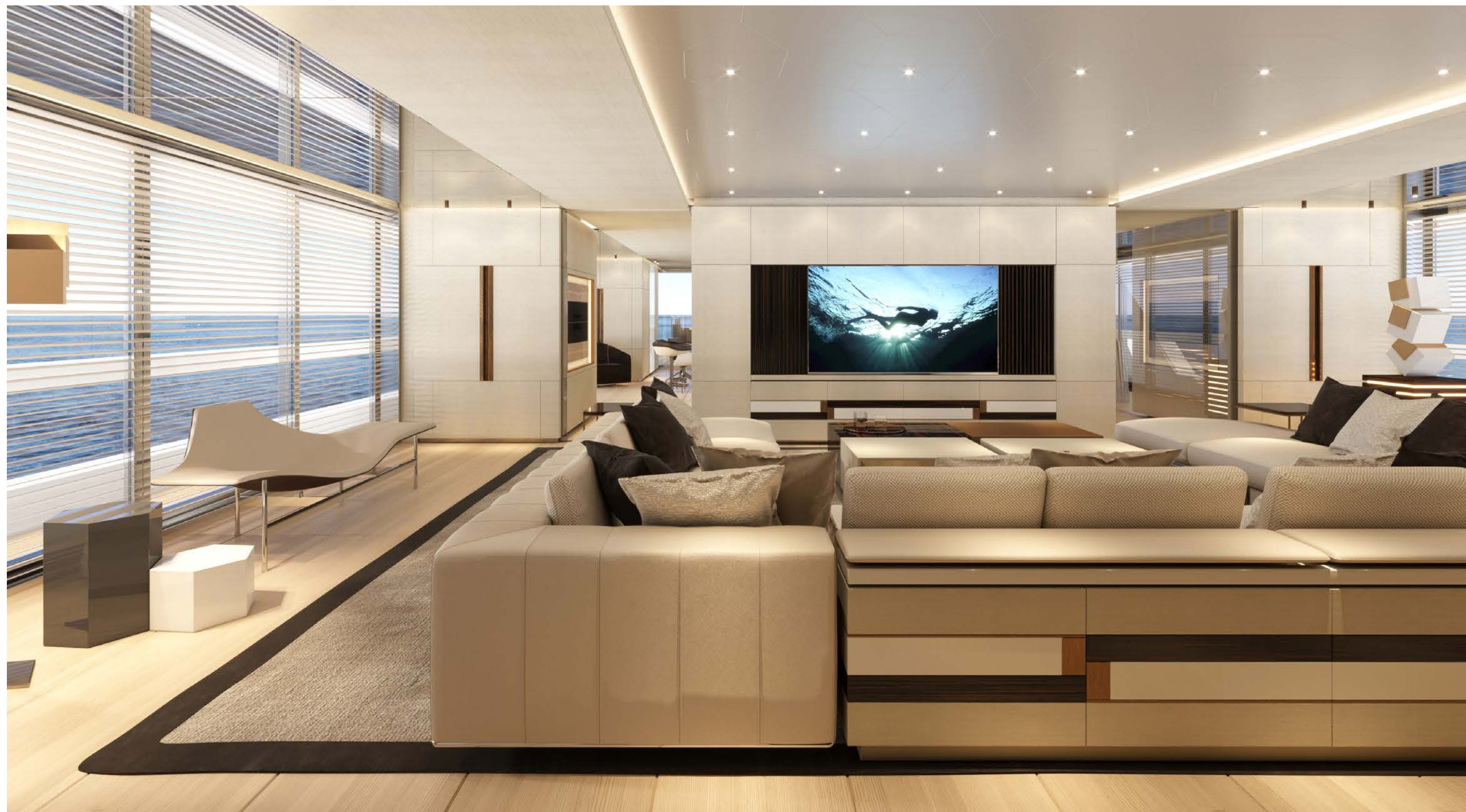
15. Main deck salon

interior proposal by Tiziana Vercellesi Design