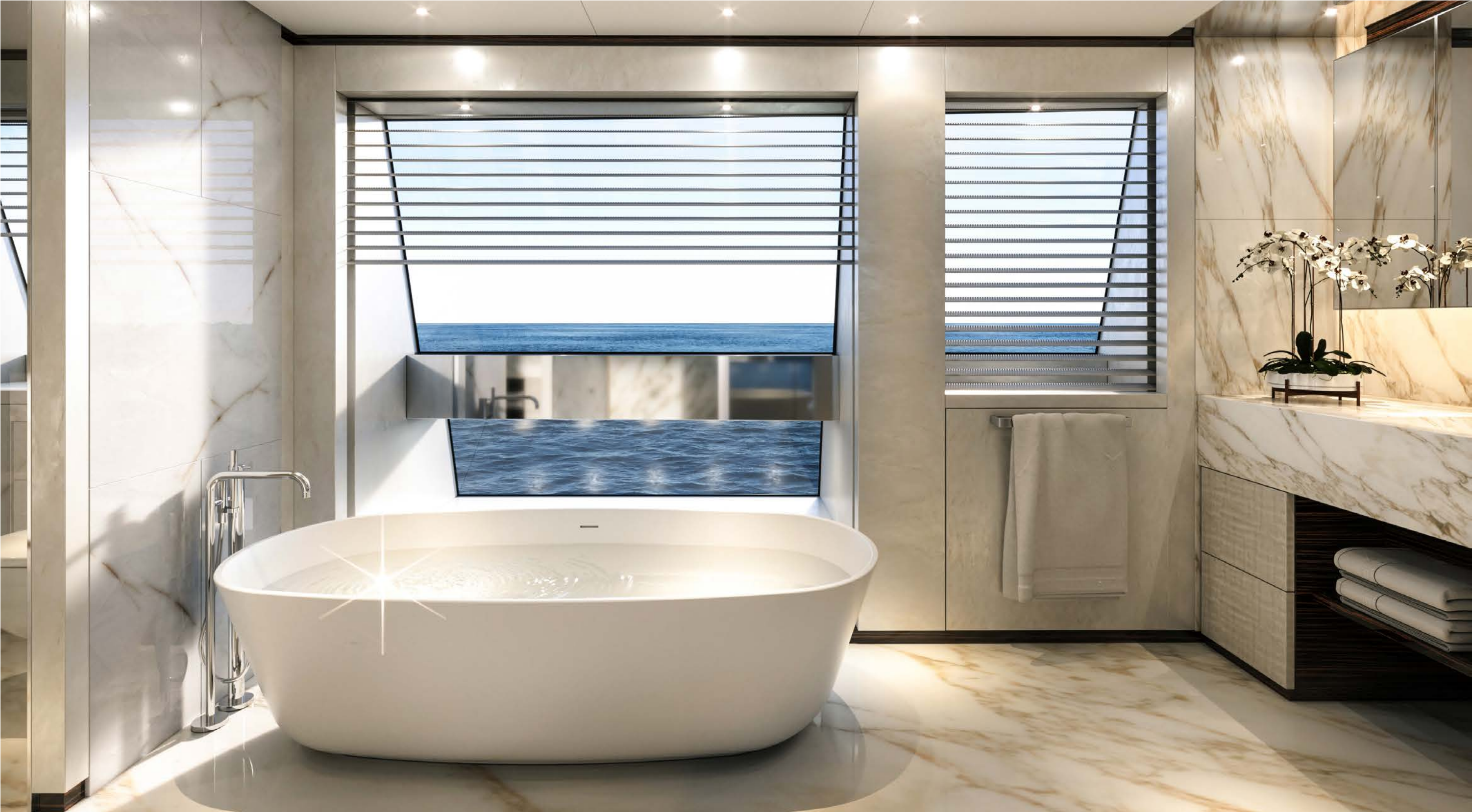
20. Owner's bathroom

interior proposal by Tiziana Vercellesi Design