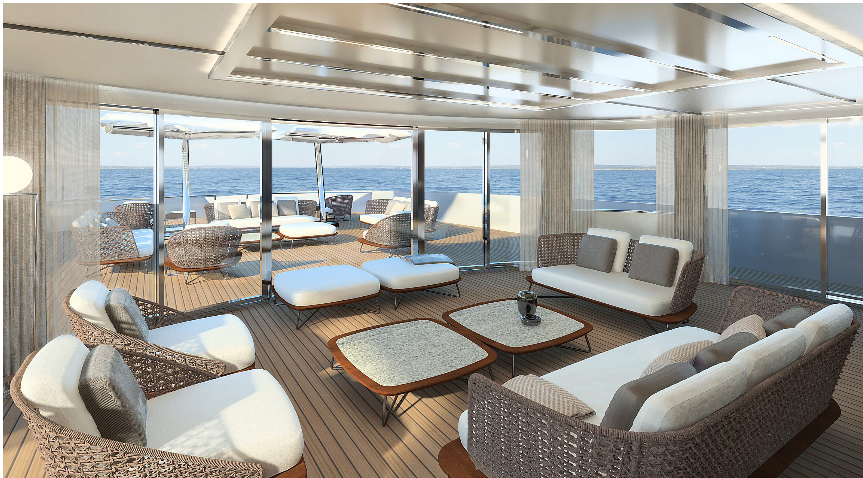
09. Upper deck salon and bow area