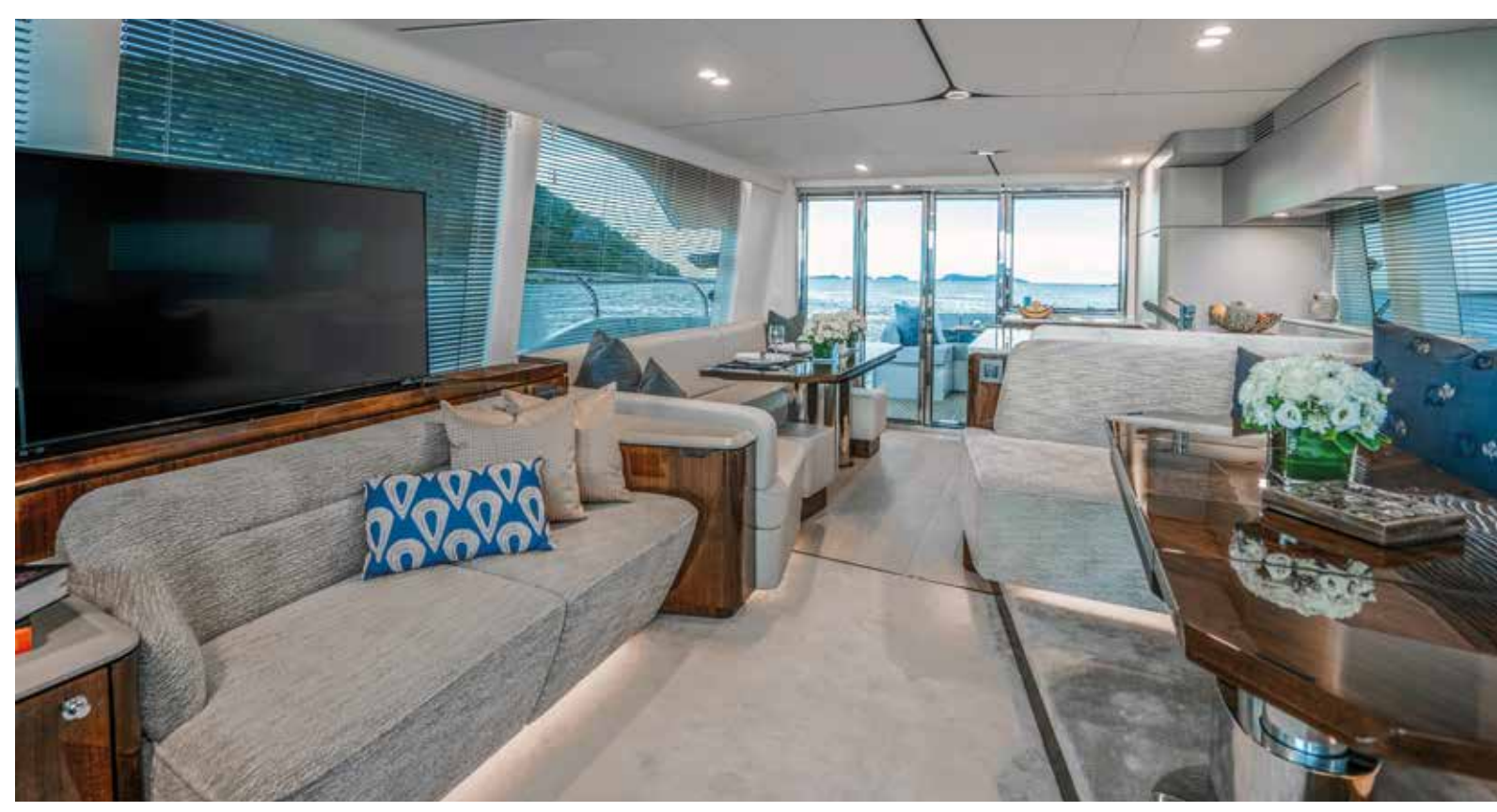
Aft view of the saloon, which features carpeted flooring and fabric-covered sofas; woodwork is in high-gloss walnut and maple

while the wood options remain impressive.