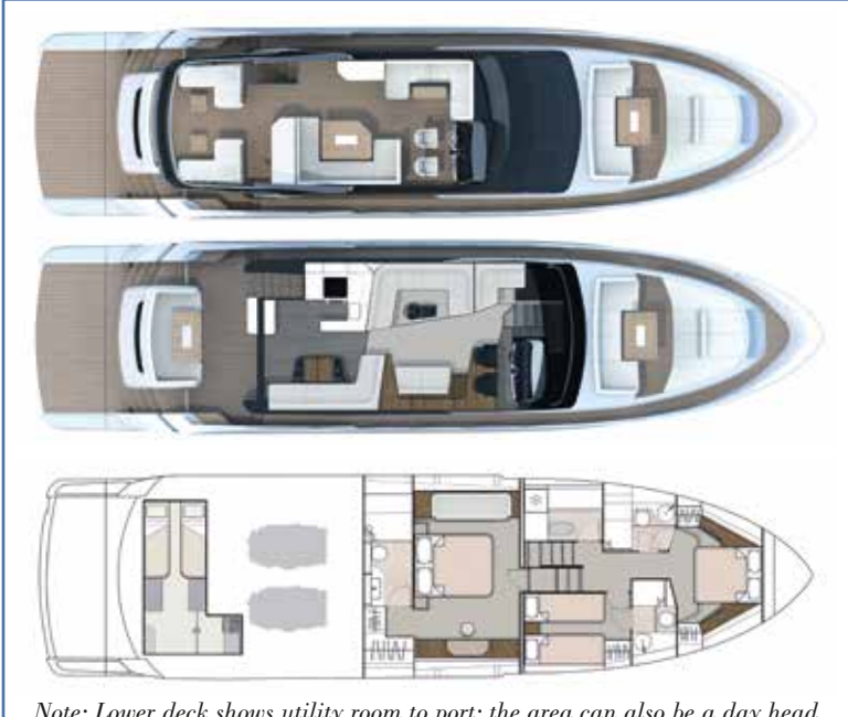
Note: Lower deck shows utility room to port; the area can also be a day head, fourth guest cabin or part of an extended forward VIP suite