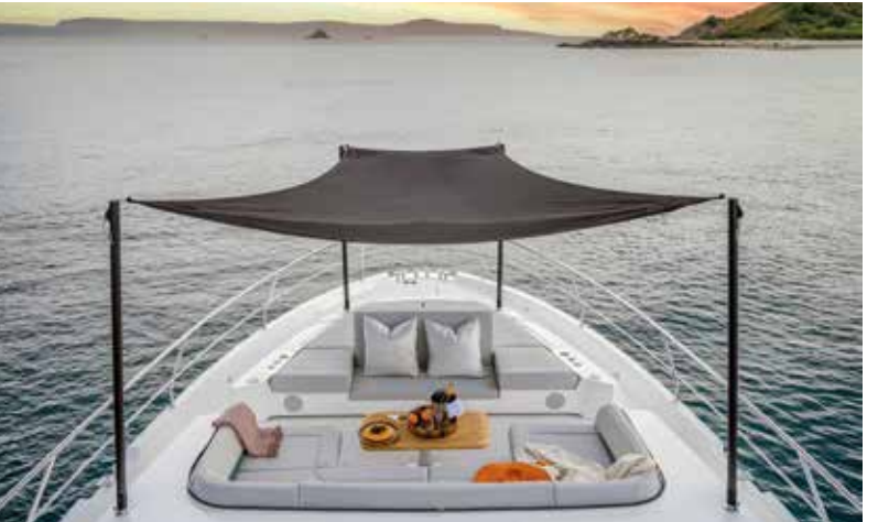
The Pattaya-based hull includes the aft electric sunshade integrated into the hard top as well as a foredeck sky bimini, also pictured on the right