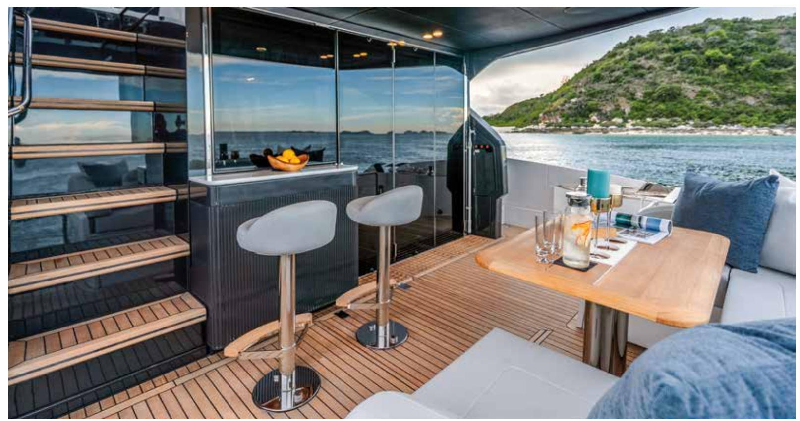
The aft cockpit has a large C-shaped sofa and teak dining table, bar stools by the galley and new tri-fold saloon door

The new edition also comes with the option of a tri-fold saloon door into the interior, where Fairline has changed things extensively,