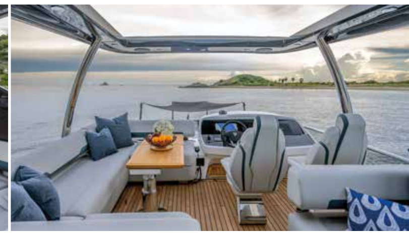
The enormous flybridge features an aft seating area (not shown), a central sofa with large dining table (left) and a forward lounge under the sunroof (right)

The original Squadron 68 was a tall-looking boat, but the new glazing and hard top disguise the height with a sporty, dynamic profile that benefits from exterior lines going in consistent directions.