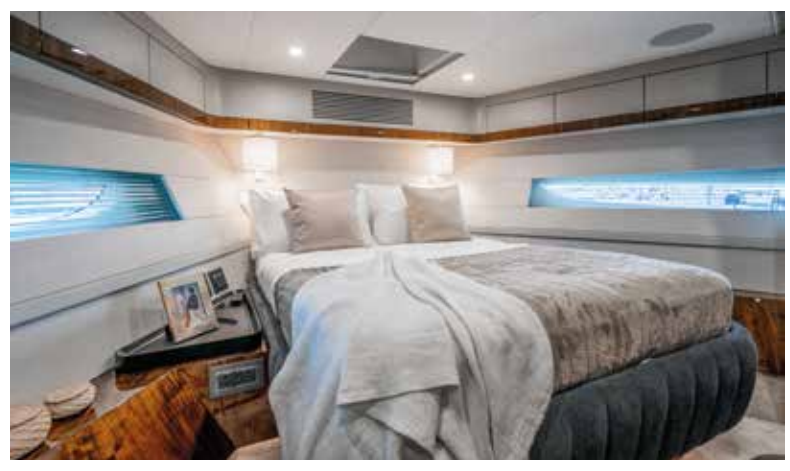
The en-suite VIP cabin in the bow includes wardrobes on both sides

and movies running on a built-in wireless router. There's also an integrated Sonos audio system with three Sub stages, flush-mounted speakers, roaming speakers, amplifiers and subwoofers, as well as mobile waterproof Bluetooth add-ons.