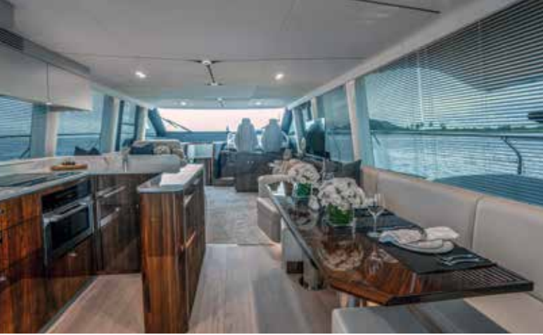
The high-low saloon table (left) is also foldable; the aft galley neighbours the starboard dining area (right), which has a leather sofa and stools