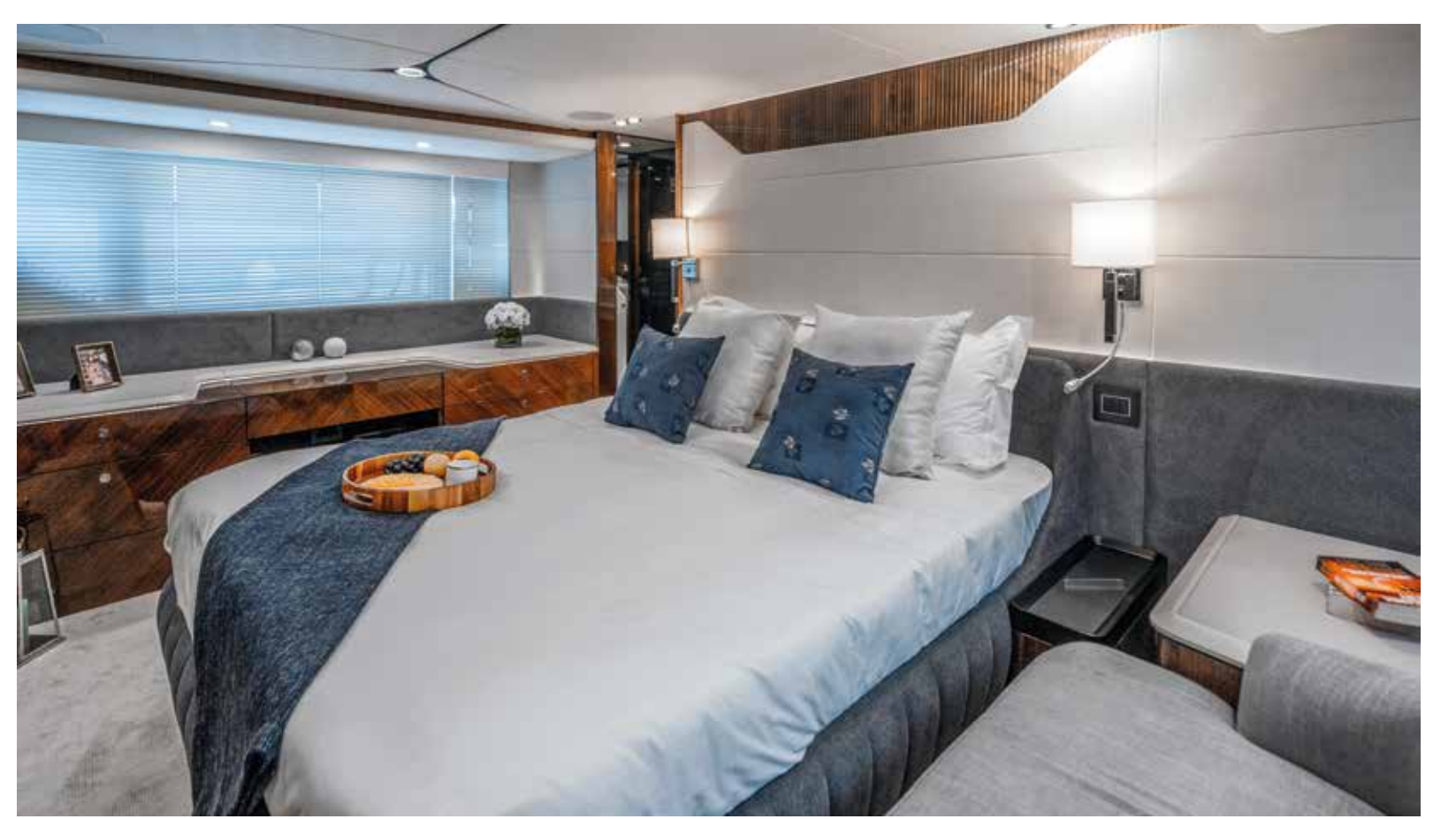
The full-beam master suite has a forward-facing king-size bed, sofa to port and bureau to starboard, while aft is the walk-in wardrobe and bathroom