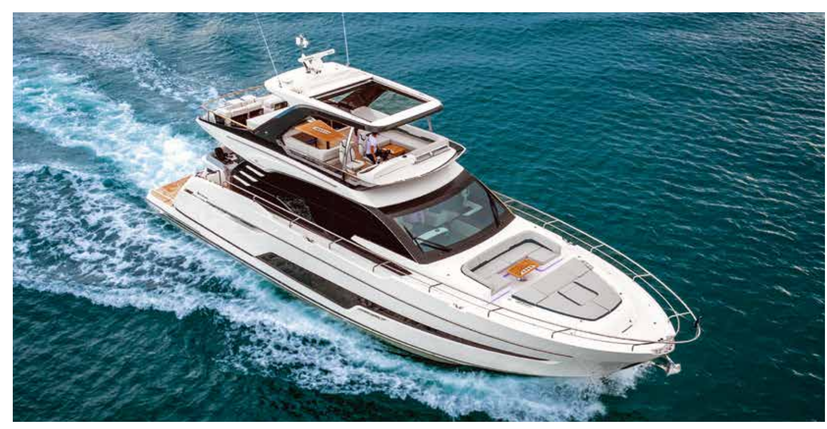
Pictured in the Gulf of Thailand, Asia's first new-edition Squadron 68 shows the model's new hull glazing and streamlined hard top with sliding sunroof

■ airline was one of the first yacht builders to reveal its line-up for this year's Cannes Yachting Festival, announcing that it would stage not one but two world premieres from September 6-11. The British builder will unveil its all-new Phantom 65 at the six-day show, while its other debutant will be the upgraded edition of its flagship Squadron 68.