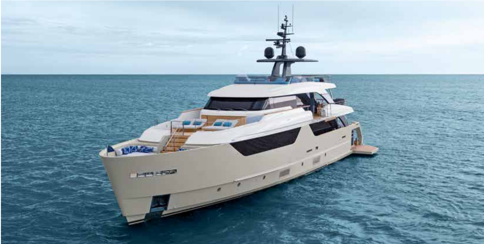
The SD118 is another Sanlorenzo design by Bernardo Zuccon of Zuccon International Project; note the two-level foredeck, with the lower area accessible from the master suite

Sanlorenzo's SD118 balances a classic exterior design with a new interpretation of interior spaces that turns expectations for yacht interiors on their head. In fact, this 36m yacht is built in durable GRP and has an almost 8m beam and a volume of 290GT due to an innovative design solution that lets the skylounge steal the show from the main saloon.