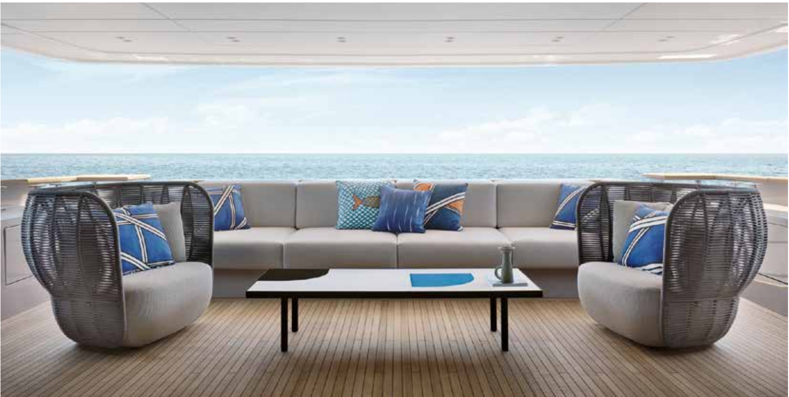
The aft cockpit on the main deck offers a large, relaxing social zone protected from the sun and with the option for loose furniture

The transom itself has a hydraulically operated central section that lowers into the water, so launching toys and other craft stored in the garage is quick and easy. Beside the terraces, there are shelves for storing scuba gear, sunscreens and the like. From this very enjoyable platform area, symmetrical staircases lead up to the aft cockpit where the yacht begins to reveal her vocation for easy, relaxing life at sea.