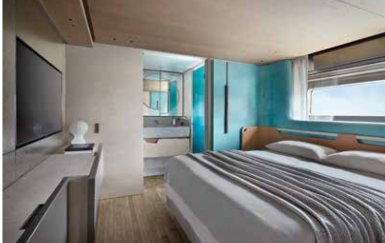
Lower-deck accommodation can include two VIP suites and two more double cabins

go about their tasks without disturbing guests, a setup that assures privacy and the best onboard experience for all.