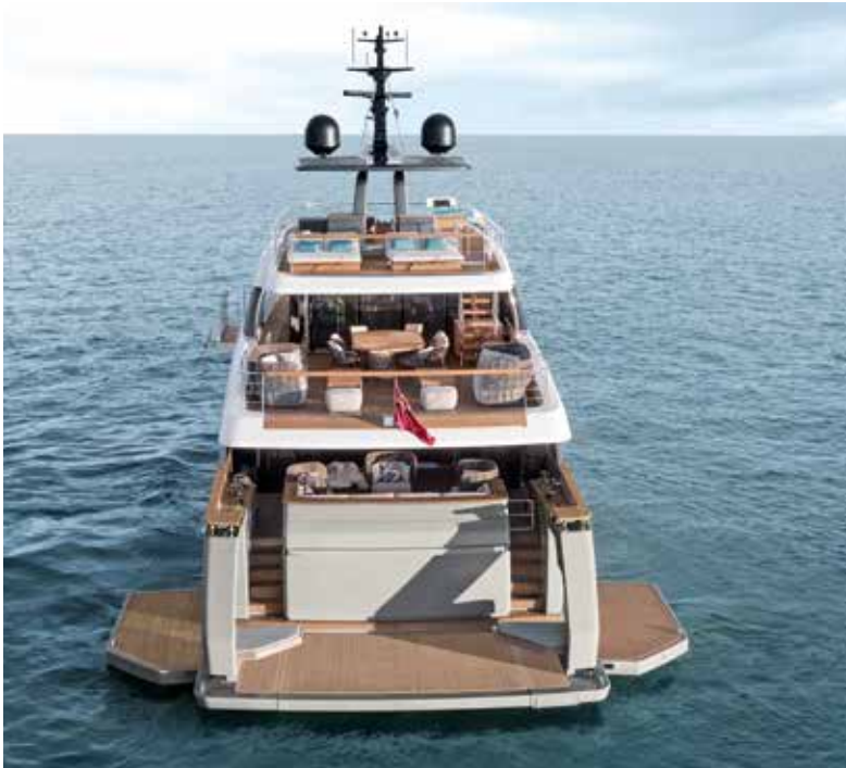
The aft sides lower to form a three-sided beach club

Classic, but with modern verve thanks to an almost vertical bow, the yacht has three decks plus a sun deck that's well integrated into the whole, leaving the yacht looking light. Zuccon remarks on how this yacht is a development on Sanlorenzo's SD line of semi-displacement yachts.