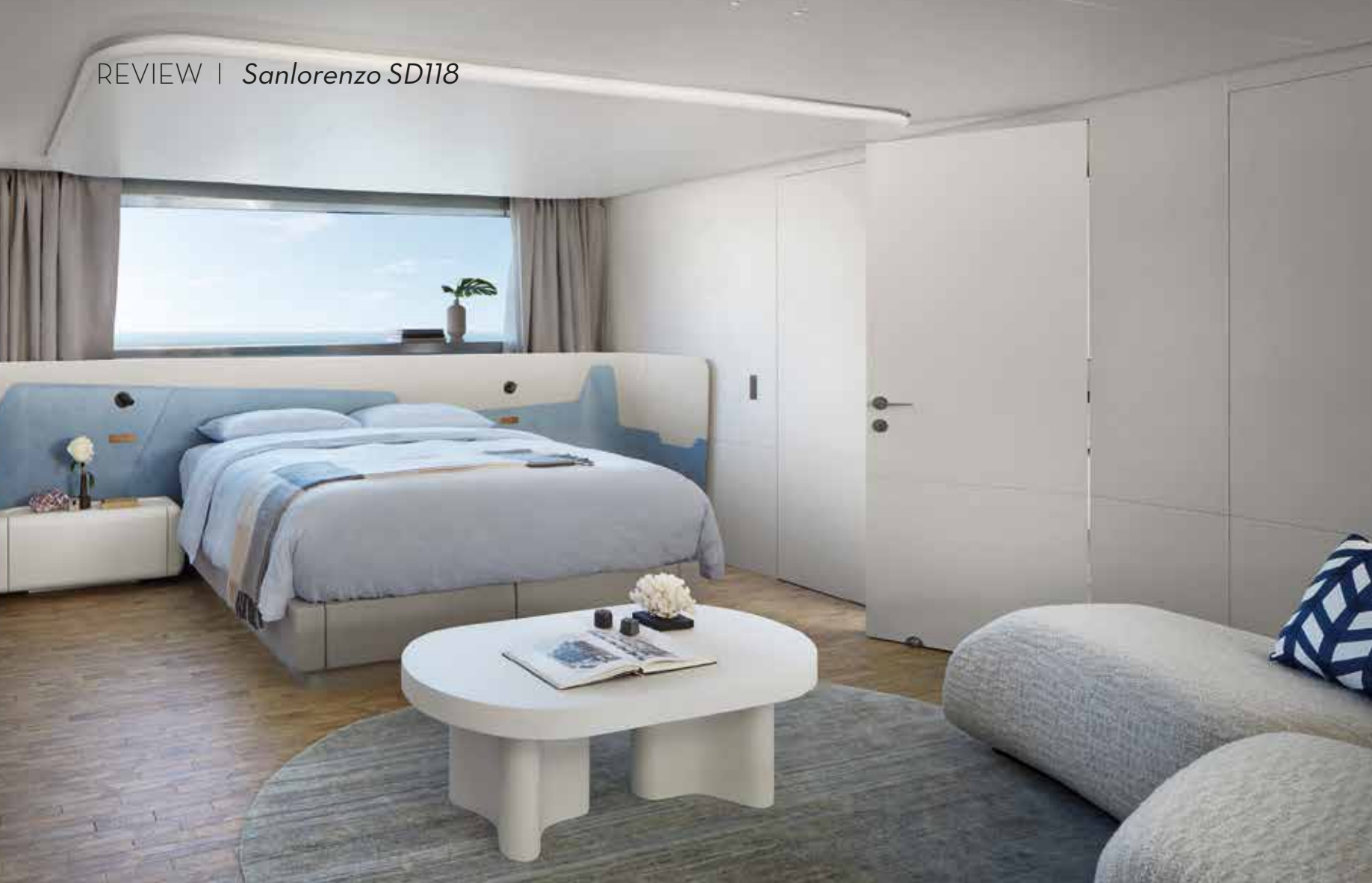
The stunning full-beam owner's suite is forward on the main deck and features an inward-facing bed under a large window

a walkaround bed placed slightly to port, leaving plenty of room for seating to starboard and an office area overlooking the water to port.