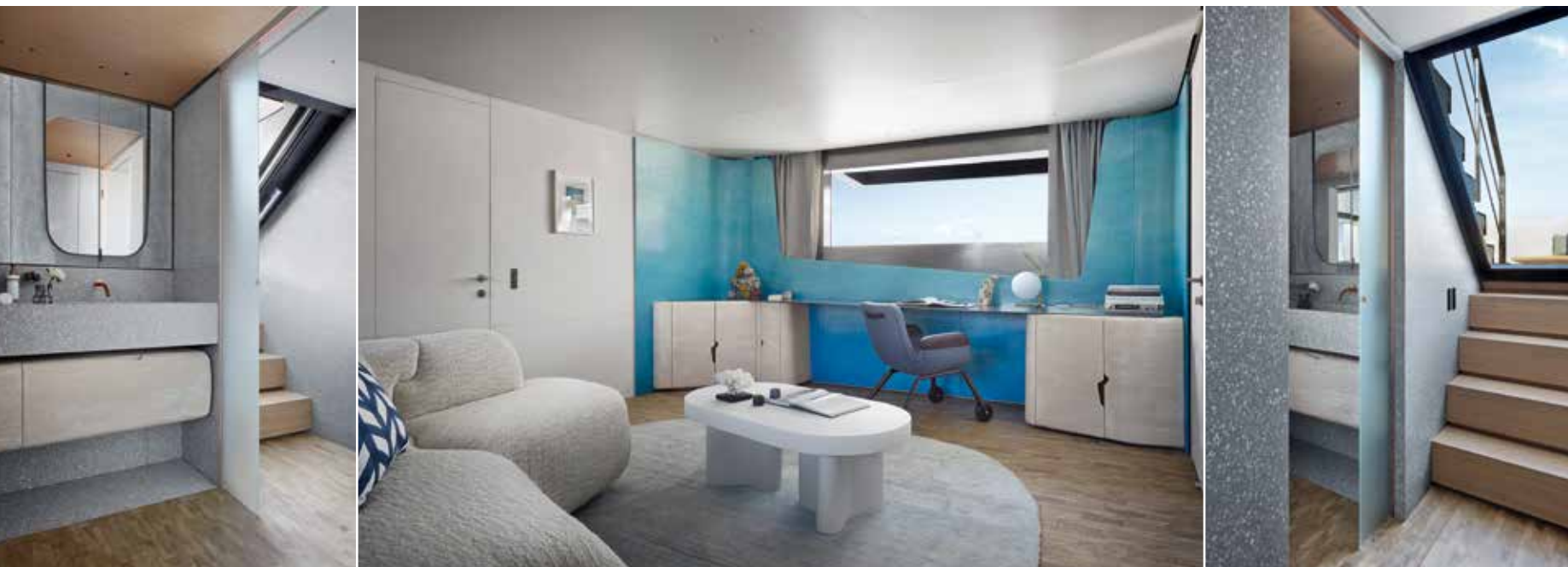
The office in the owner's suite (middle); the bathroom (left and right) has separate compartments either side of a central staircase to the forepeak

Zuccon calibrated interior weight distribution so the SD118 is well balanced, even though this large living space is asymmetrical. Add that the portside gunwale folds down to become a balcony and you have a skylounge that is extra-wide during navigation and feels