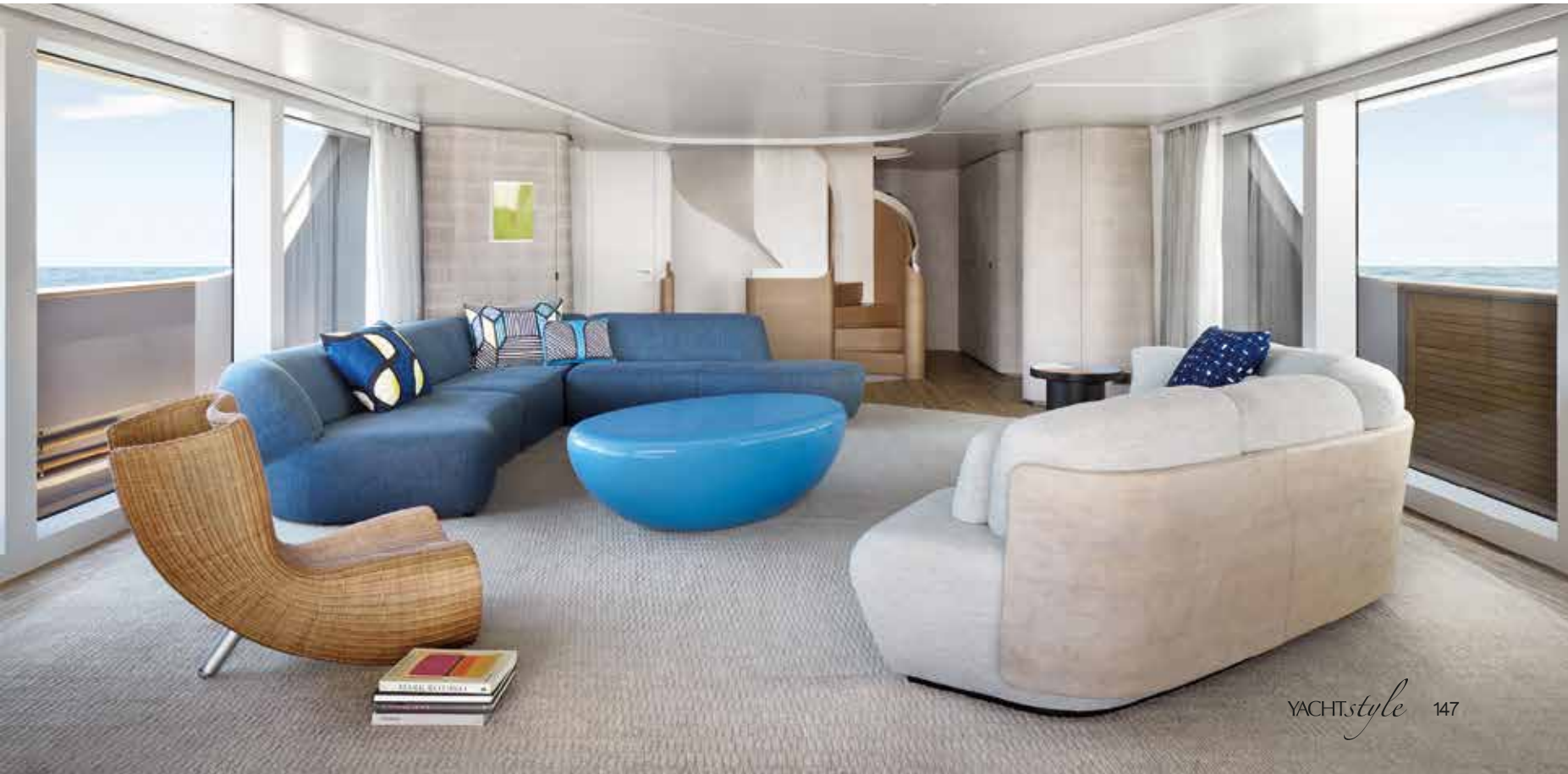
Forward view of the saloon on the main deck, which culminates in elegant, curved staircases to the upper and lower decks; photos show a Patricia Urquiola interior

Fore on the main deck, past the galley and the lobby, lies the owner's suite. With a large walk-in closet, this full-beam cabin has