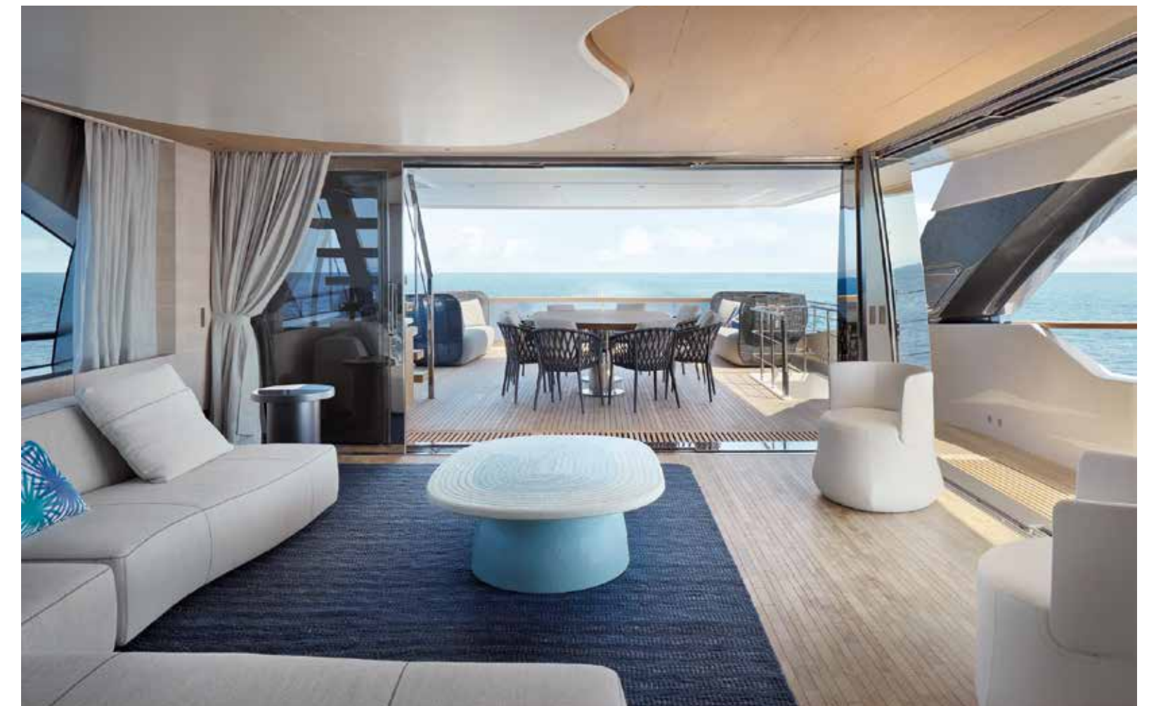
Aft view of the skylounge on the upper deck, where the covered aft deck offers a large area for alfresco dining as well as sofas by the clear balustrade

The crew area, also on the lower deck, has cabins for up to five, enabling a two-to-one guest-to-crew ratio that assures comfortable, luxurious long-term stays. All work paths are to port so crew can