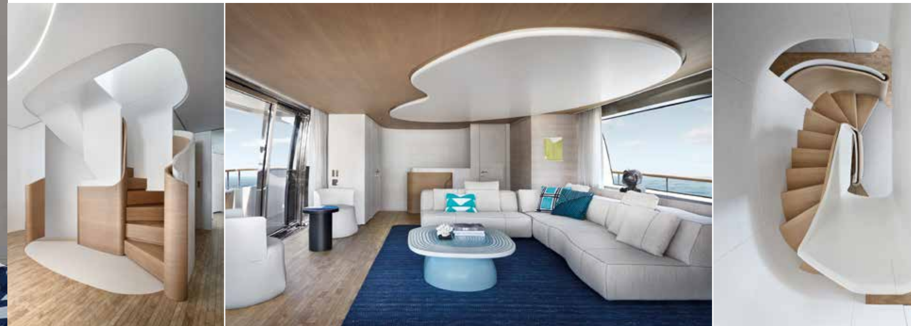
Staircases (left and right) are a part of the artistic interior design of Sanlorenzo yachts; the skylounge (middle) on the upper deck has open doors to the portside walkway

practically infinite when the yacht is at anchor, with the balcony down and the sliding glass doors open.