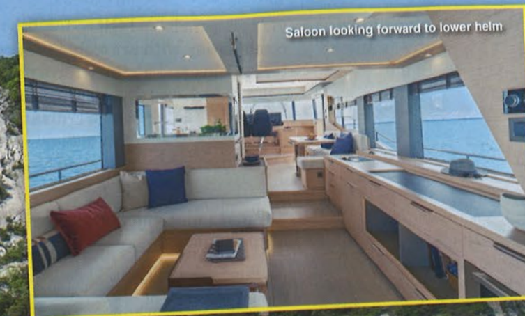
Saloon looking forward to lower helm