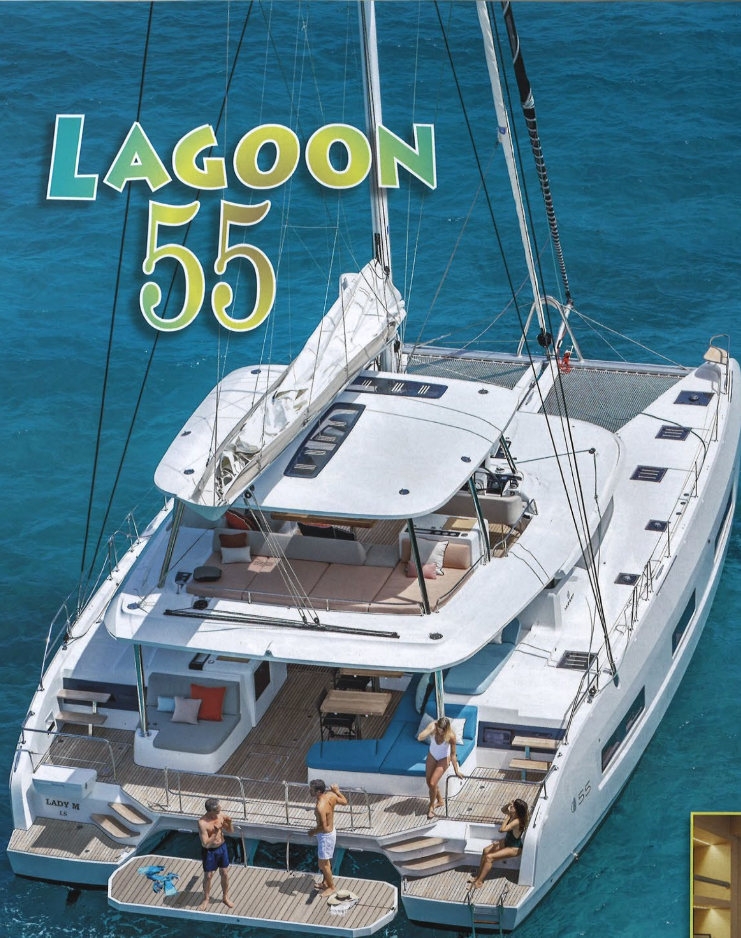
The Lagoon 55 has a re-configured aft area which improves circulation and creates a large terrace over the sea