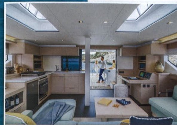
Another stunning feature is the internal overhead windows, which provide a breath-taking vista of star-studded skies