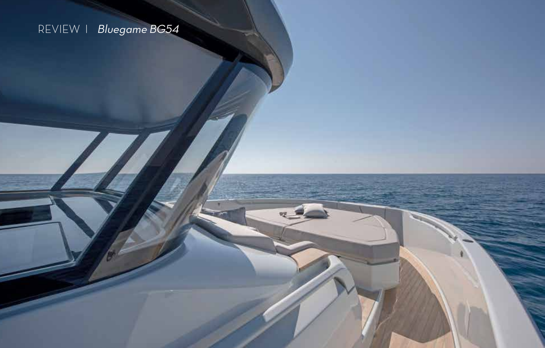
Accessible either side of the forward-raked 'wheelhouse', the foredeck has a forward-facing sofa and sunpads

you updated on running systems and easy-to-use IPS joystick controls. Carbon-fibre slats in the roof let light in and air circulate freely, while to port of the helm, a ladder leads up to the roof where sun worshippers can get all the rays they crave. Side passages to the foredeck are wide, while high bulwarks keep all aboard safe. A handrail runs along the coachroof, with winches, cleats and fairleads concealed under a hatch at the forepeak. The hatch to the anchor chain locker is flush to the deck. All these details keep the look of this technical space clean, so it can also double as a guest area with a couch and sun pads. Making the most out of every inch makes the BG54 a 'larger' smaller-sized boat and assures that everyone aboard finds the spaces they need. "At this size, Bluegame's designers have worked hard to utilise the