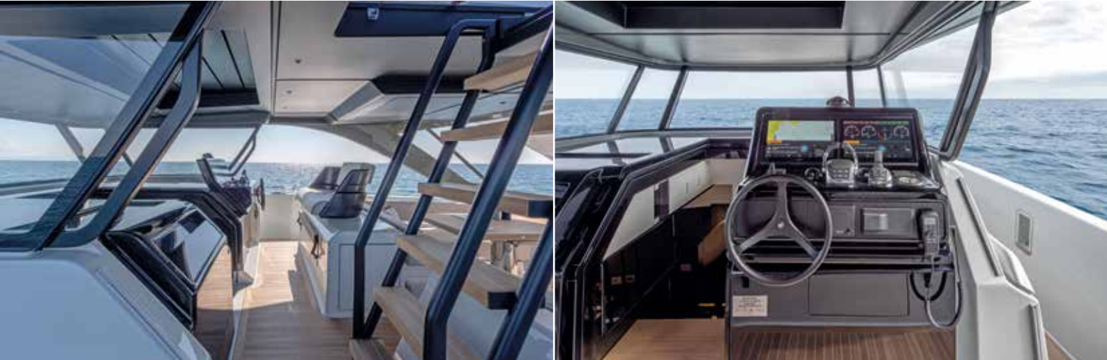
Forward of the cockpit are the ladder to the sunroof, stairs to the lower deck and the helm station, which has a carbon-fibre sofa on top of a locker

space as best as possible, but there's always room to adapt," Stratton confides. "For example, we worked on a proposal with a client in Southeast Asia who wanted to use the yacht for diving, so we designed a custom dive storage area by adding extra showers, dive compressors and so on." CABINS AND MORE Head down the companionway by the helm and you'll see that the BG54 is much more than a day cruiser. A wall of darkened mirror helps make the stairs seem wider than they are and gives a sense of airiness to the lower galley, which has a convection cooktop, microwave oven, fridge and dishwasher. Fore is a full-beam en-suite cabin that can be the owner's cabin in the three-cabin layout or a VIP in the two-cabin version. Aft of the