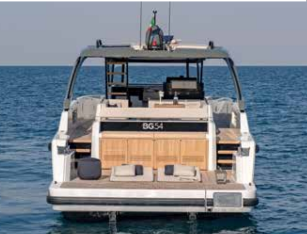
Social areas include the walkaround foredeck (left); the sunroof (centre) adds a third social level; the aft galley and huge swim platform (right) are signature features