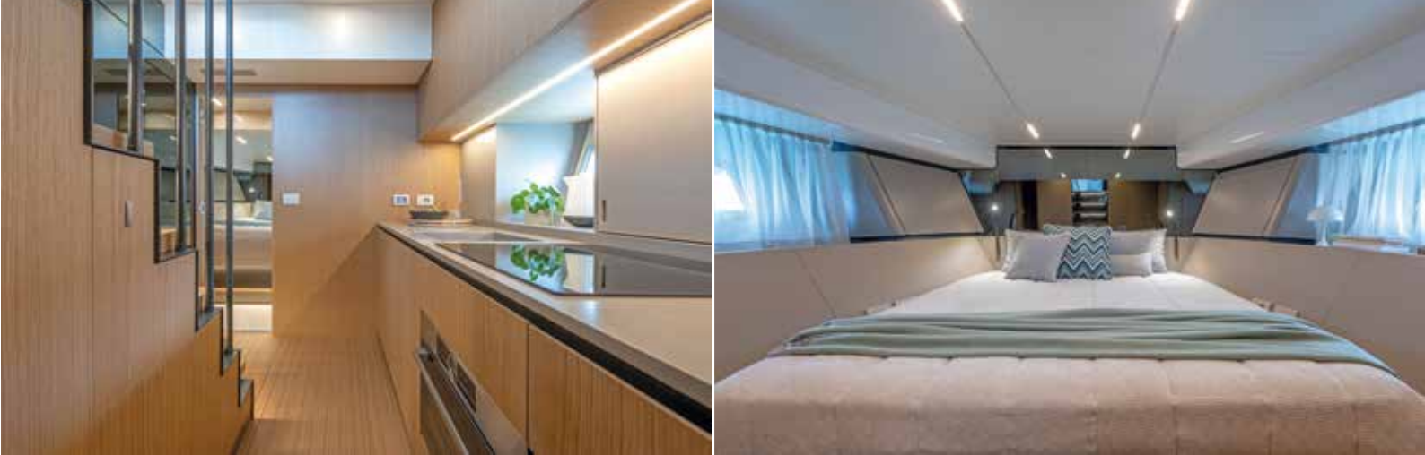
The surprisingly spacious lower deck has an elegant galley to starboard and a day head to port that can be accessed from the forward cabin

galley, owners can choose between having a rather grand full-beam en-suite cabin or two twins that share a bathroom. Clean, modern furnishings keep the spaces stylish throughout the lower deck, all the way down to the bowl basins in the bathrooms. But sometimes you don't want to do it all yourself and that's why the BG54 even has an en-suite crew cabin aft. Space for this extra helping hand, a real boon when you just want to relax with your friends and family, is available because of the IPS propulsion system. This win-win Volvo Penta technology gives you more than a smoother, vibration-free ride that's more energy efficient. In addition, its smaller dimensions allow the engines to be placed further aft, leaving more room for guests and also crew. In fact, the BG54 doesn't really have an engine room; it has an open-air engine locker under the aft deck. A smaller inspection hatch can be opened manually or a larger cover can be hydraulically operated. No matter what size of job you need to do, you're breathing and moving freely, not in a dark, cramped and enclosed space. Sturdy, seaworthy and practical, but also convivial and safe, the BG54 packs a lot of qualities into 54ft and puts them into a stylish package. Whether you use it as a day boat or as a home for coastal exploring and island hopping, this newcomer has a lot to offer. ½