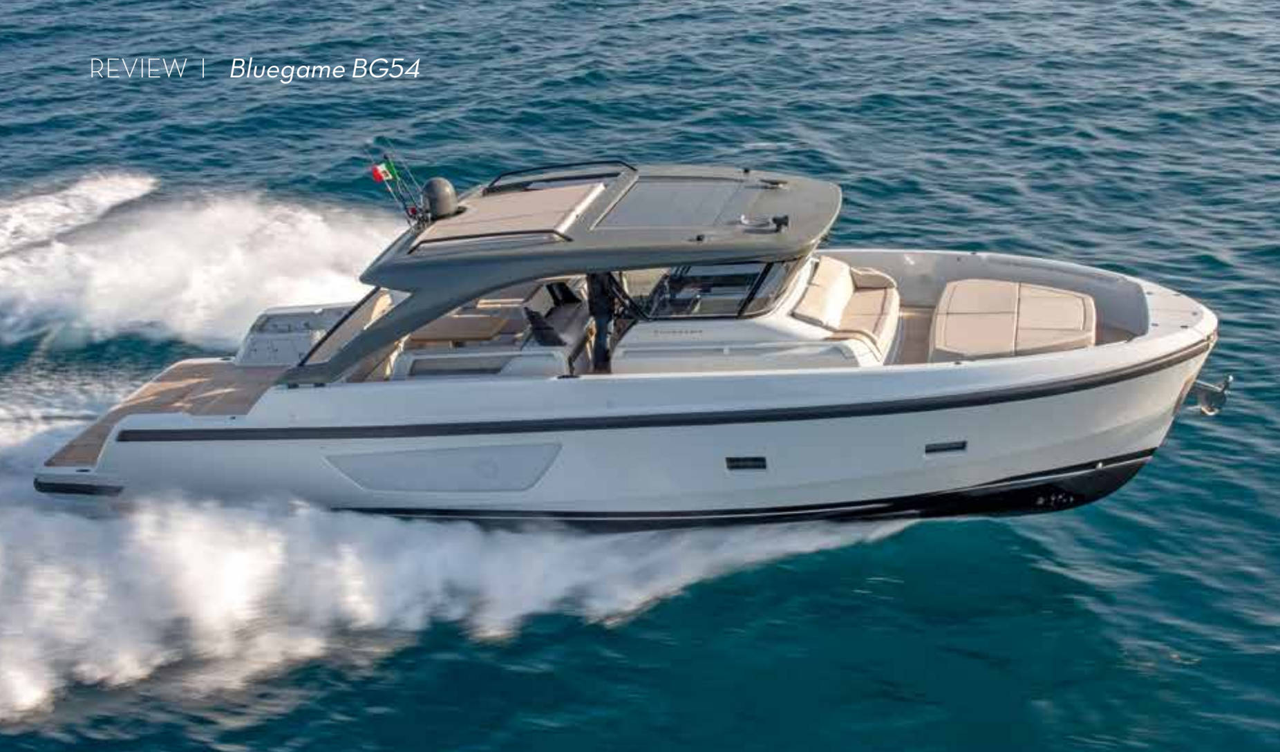
Already in huge demand and sold out until 2024, the BG54 can reach 30 or 35 knots depending on the choice of Volvo Penta IPS engines