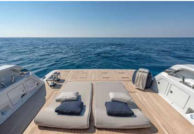
The huge swim platform has become an iconic Bluegame feature and echoes similar designs on recent models from parent company Sanlorenzo

an outdoor galley that can be equipped with a sink, grill, fridge and icemaker. It's just three steps up to the cockpit, so preparing drinks or cooking a meal are an integral part of the boat's social life.