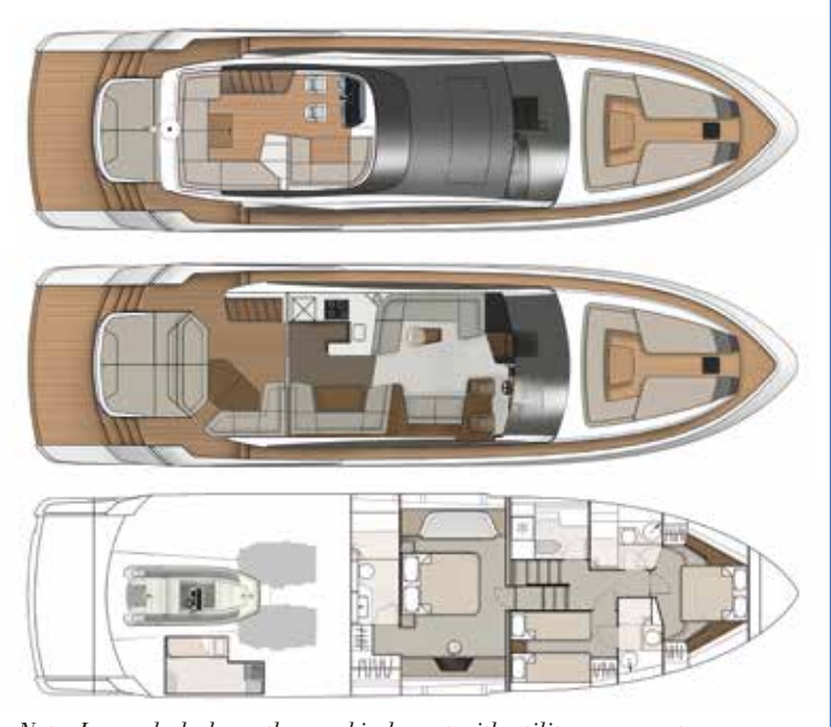
Note: Lower deck shows three-cabin layout with utility room; port room can be a bunk cabin, day head or en-suite bathroom for extended VIP cabin