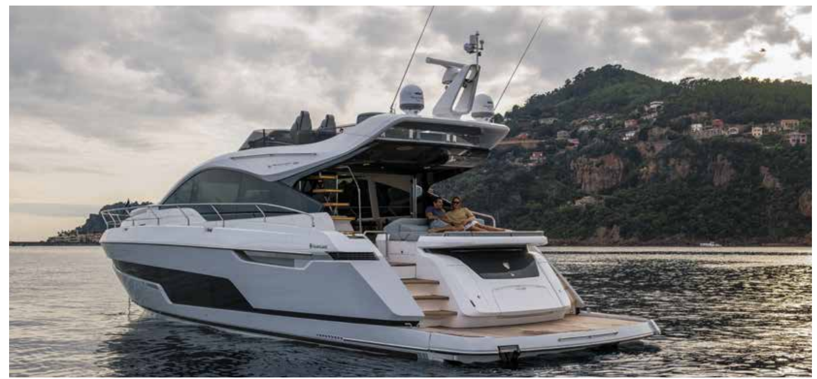
The aft platform has a 400kg-lifting capacity, the garage can house a Williams 345 SportJet, while the garage door features a fold-out sofa

On the main deck, most woodwork is only used up to waist height, such as in the open, J-shaped galley to port. The full-height fridge-freezer illustrates this, featuring fluted doors – dark walnut on the bottom door and a light colour on the top door, matching the white marble countertop and overhead storage above the cooking area to port.