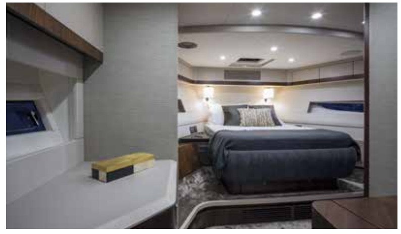
Forward view from the port hallway of the extended VIP suite

sides and en-suite to port. In the extended VIP layout, the bedroom door is to port, where there's bathroom access and a long storage cabinet. At the foot of the bed is a vanity table with large bulkhead mirror beside a Samsung TV with fluted panelling above and below.