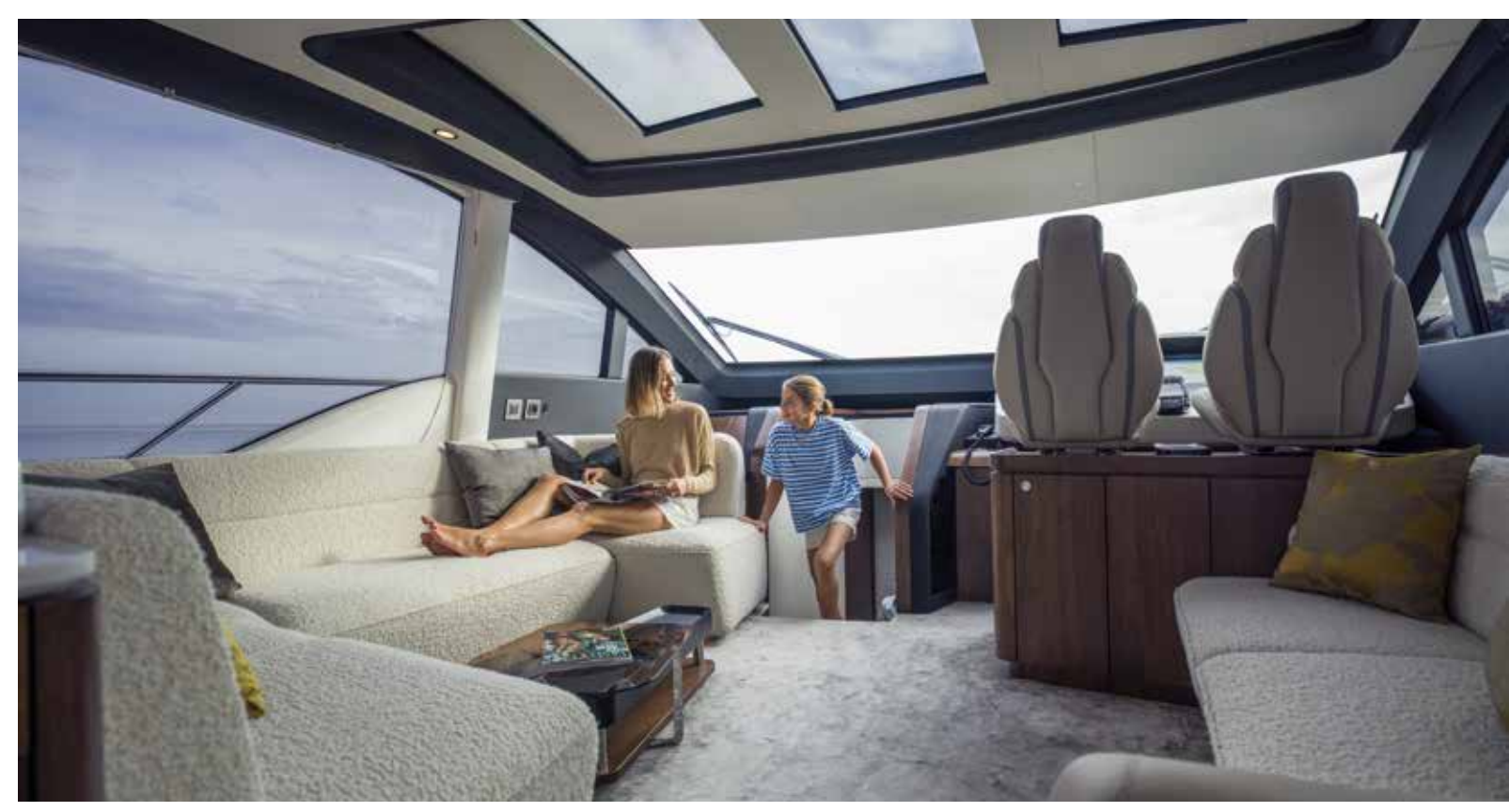
The saloon features textured upholstery, natural-fibre carpeting, sofas on both sides and a sunroof (shown in the closed position)

The dining area to starboard has a C-shaped sofa, loose stools and a fixed-height dining table that can fold out on both sides. The table looks better folded out, as it reveals the matching grain of adjacent wenge leaves and a gorgeous central strip of natural quilted maple.