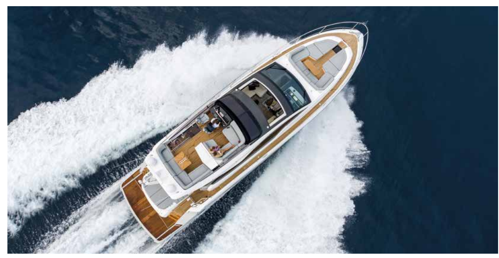
The spacious sportbridge on the Phantom 65 offers an L-shaped dining area aft, wet bar, forward sofa/sunbed and twin-seat upper helm

ollowing the launch of the F//Line 33 in 2019, Fairline's introduction of the Phantom 65 late last year represents the Oundle shipyard's second new series in three years. While the F//Line 33 provides a sexy offering in the luxury dayboat sector, the first Phantom is a sleek sportsfly that acts as a bridge between the brand's Targa 65 GT cruiser and full-flybridge Squadron 68.