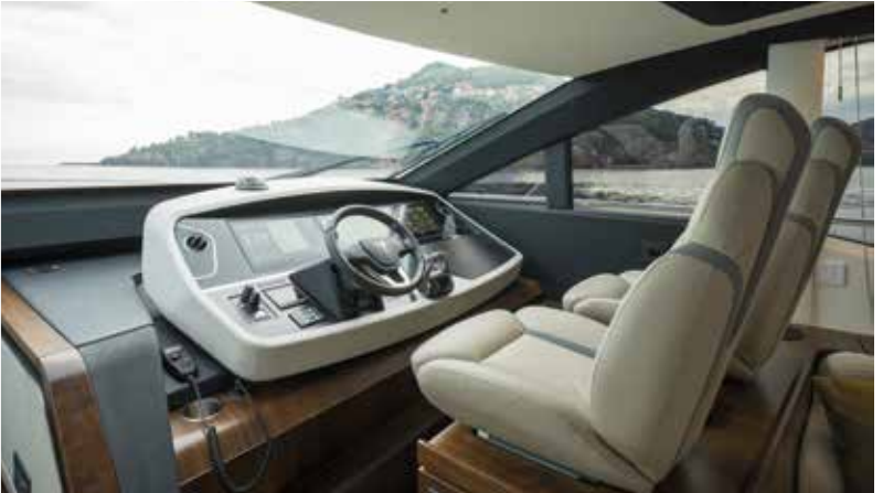
Opening the sunroof (left) allows more natural light and ventilation; the twin-seat lower helm (right), shown without the optional side door