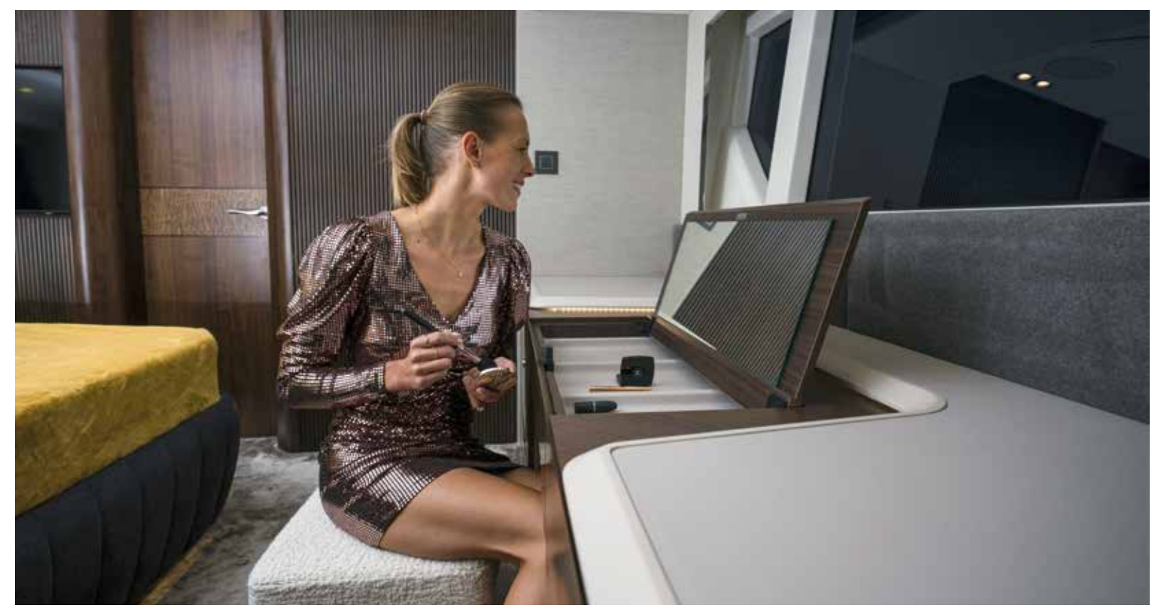
The full-beam master suite has a starboard bureau with drawers each side of a vanity table; fluted panelling is used on the forward bulkheads