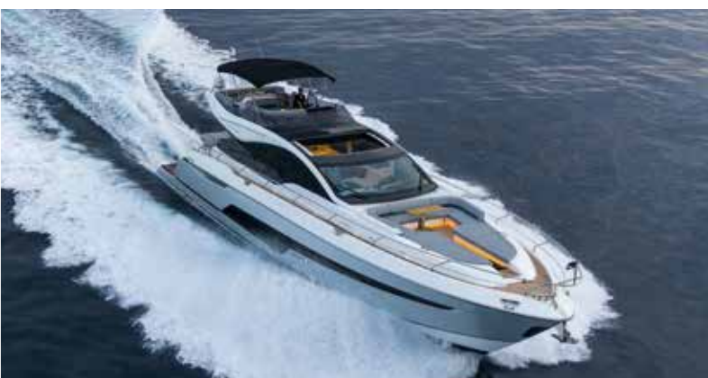
With its elegant superstructure and discreet sportbridge, the Phantom 65 cuts a sleek figure with or without the optional bimini