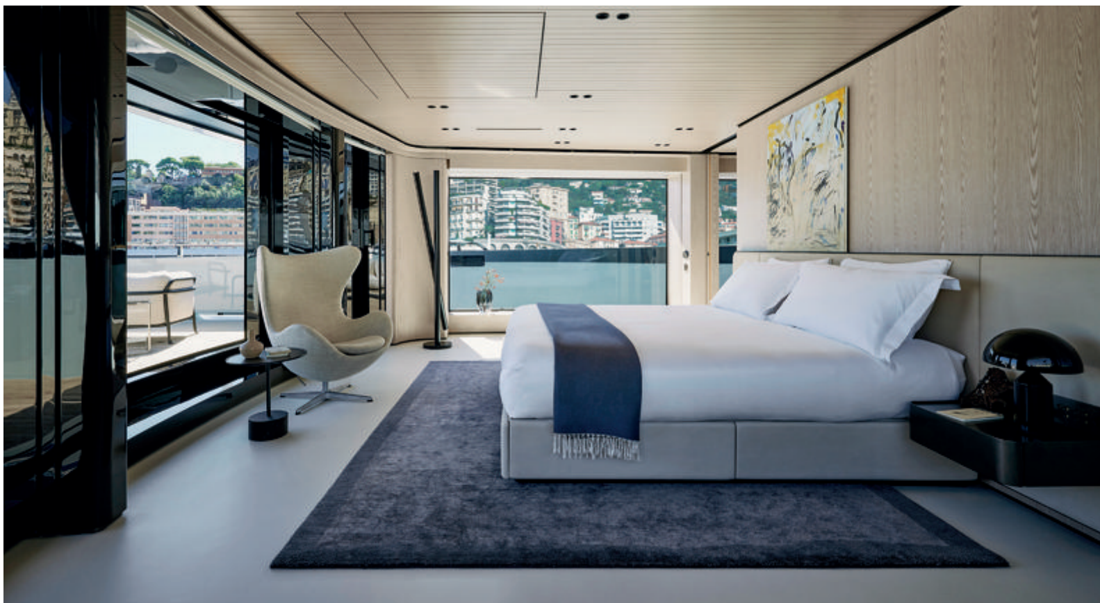
On Virtuosity, the 580sqft owner's suite on the upper deck looks out onto an enormous foredeck that includes a private pool

below, including two doubles and two twin cabins, one of which can serve as a staff cabin.