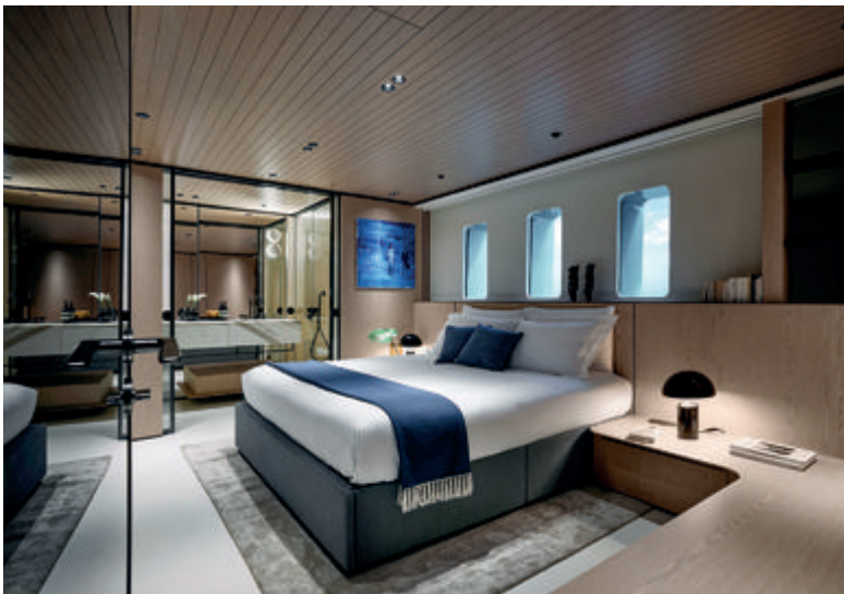
One of the four guest cabins on the lower deck

The clients are also very interested in onboard technology, particularly in audio/video systems, so Virtuosity has a DJ area at the aft of her bridge deck with a space for DJ decks and a bar, creating a dedicated space for celebrations. The party space, along with a main-deck pool area and a huge beach club on the lower deck, proves that Virtuosity is all about entertainment.