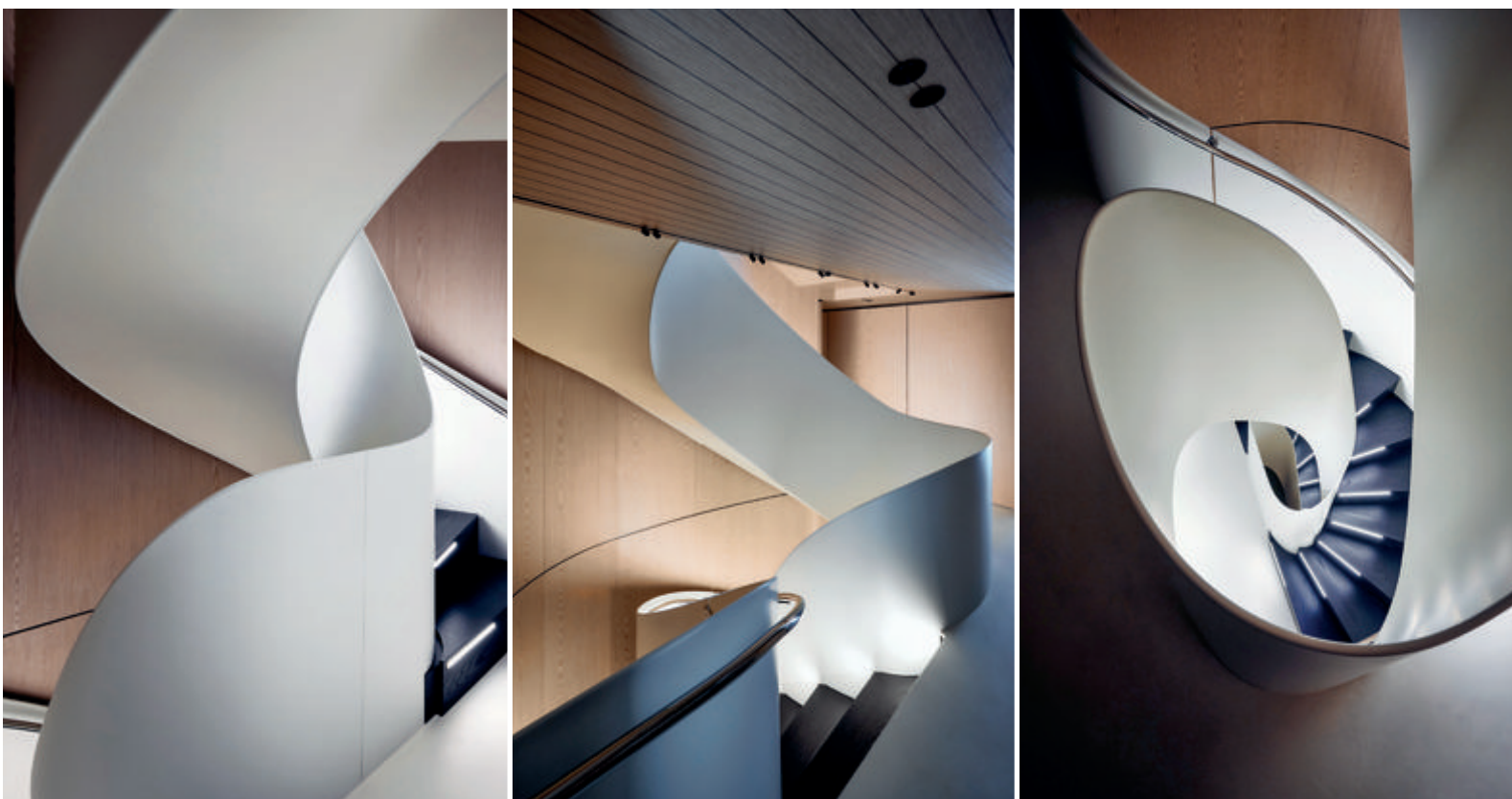
Designed by Lissoni, the showpiece steel-and-aluminum staircase winds up and down all four decks: lower, main, upper and bridge