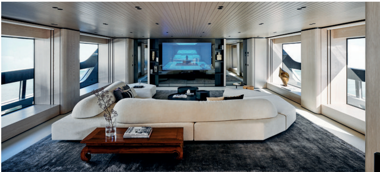
The upper-deck saloon includes an enormous sofa facing a large TV screen and can be used privately by the owner if desired

Rossi says: "It was a stimulating challenge not only from a formal and stylistic perspective but also from an engineering and craftsmanship standpoint due to the complexities arising from placing such a sculptural staircase in such a compact space with a complex structure."