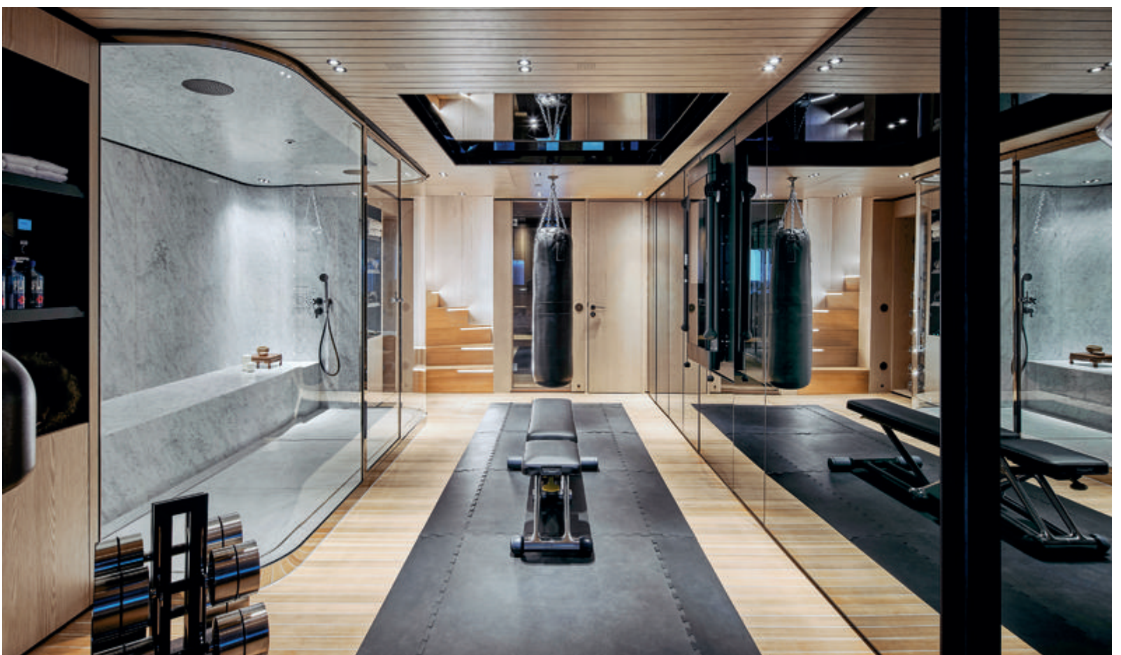
The lower deck of Virtuosity includes a gym, as well as the beach club, four guest cabins and the crew quarters

On the main deck forward is a full-beam stateroom that would make for an enviable VIP cabin or a worthy second owner's suite for dual charterers. A further four cabins are found on the lower deck