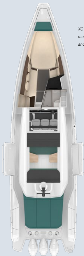
XC Cross Cabin w. optional multistorage compartment and side balconies open