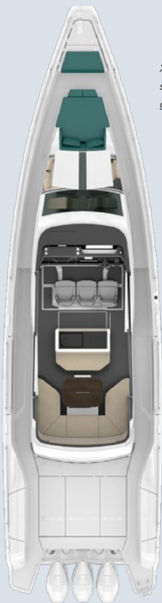
XC Cross Cabin w. standard open aft deck and gullwing doors open