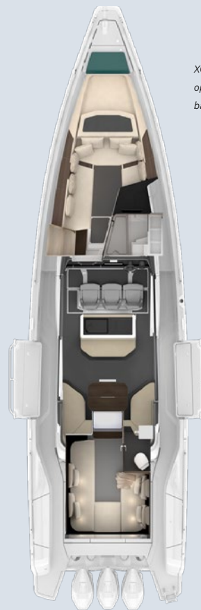
XC Cross Cabin w. optional aft cabin and side balconies open