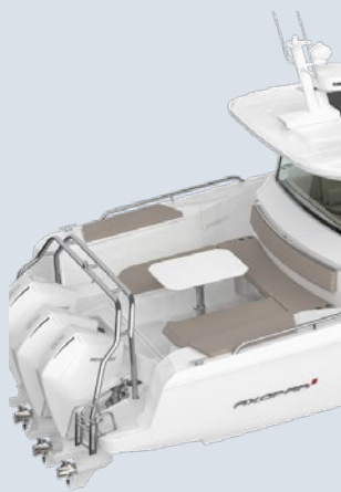
XC Cross Cabin w. optional Multi Storage Compartment