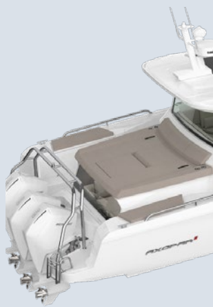
XC Cross Cabin w. optional Aft Cabin