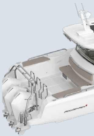
XC Cross Cabin w. optional Aft sofa